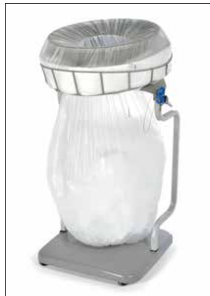
Stand Classic Recycling