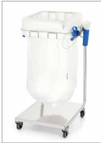
Stand Dynamic Midi/Midi Pedal