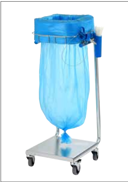
Stand Dynamic Mini/Mini Pedal