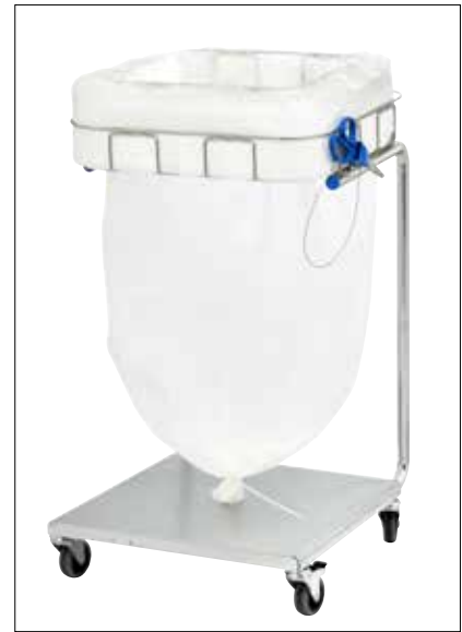
Stand Dynamic Maxi/Maxi Pedal