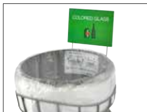
Sign holder for Longopac Stand Classic & Dynamic For item no. see charts on Stands and Dynamic. Signs are available in A4Portrait or A5Landscape.