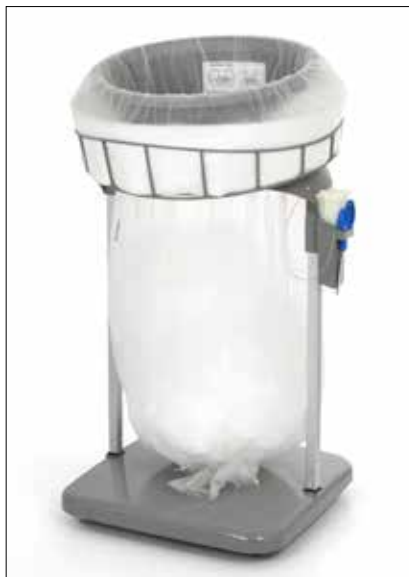
Stand Classic Maxi/Maxi Food