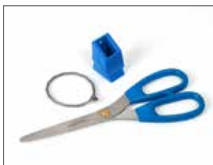
Scissors kit for Longopac Stand Dynamic, metal-detectable Item no. 34609 Kit containing metal-detectable scissors, scissors holder, stainless steel wire.