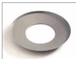
Adapter disc for Longopac Stand Classic Maxi Item no. 30170 Reduces the aperture for easier compression of e.g. recycled plastic. Only available for Maxi.