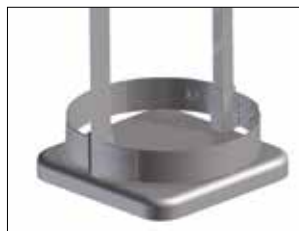
Frame for Longopac Stand Classic Maxi Item no. 33900 The frame holds the bag in place.