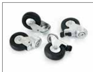
Stand Dynamic ESD Kit Wheels Item no. 34616 Contains four castor wheels, two of them with brakes. Replaces the original wheels on stands used in ESD restricted areas.