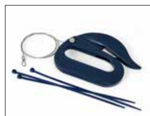
Safety kit Cutter blue kit Item no. 30440 Contains cutter, metal detectable PP. Wire in stainless steel and cable ties, metal detectable PA