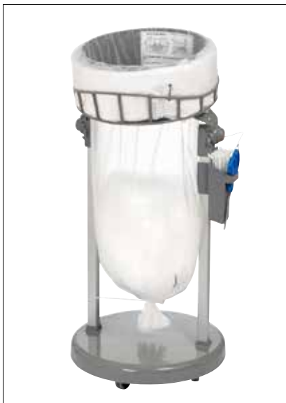
Stand Classic Mini/Mini Food