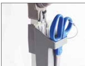
Cable-tie holder for Longopac Stand Classic Std grey. Item no. 30410 Metal-detectable, blue. Item no. 30416 The cable-tie holder is suitable for both Maxi and Mini, and available in two versions.