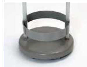
Frame for Longopac Stand Classic Mini Item no. 33890 The frame holds the bag in place.