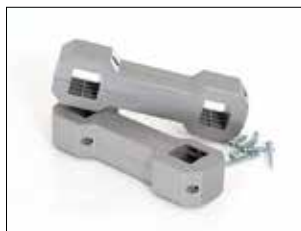
Connector for Longopac Stand Classic Item no. 33750 Connects two or more Longopac Stand products simply and securely. It is also possible to connect Maxi to Mini.