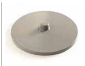
Lid for Longopac Stand Classic Maxi and Mini Mini Item no. 31140 Maxi. Item no. 30140