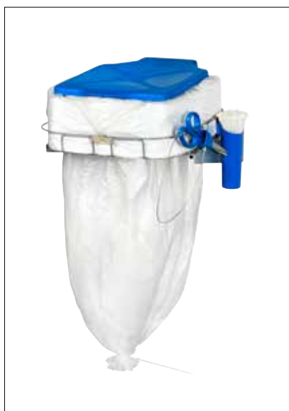
Mini Flex with lid

Two new products have been added below. Mini Flex with a lid and the first Midi version. Wall-mounted solutions are ideal for areas with limited space and where hygiene is important. They also facilitate cleaning.