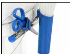
Cable-tie holder for Longopac Stand Dynamic Item no. 30410 (only holder) The cable-tie holder for the Dynamic range is suitable for Mini, Midi and Maxi Dynamic.