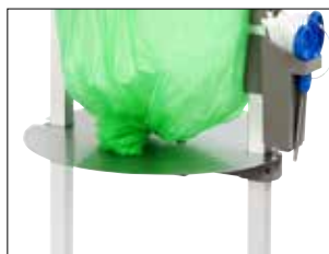
Adjustable plate for Stand Classic Mini Item no. 31480 Reduces the consumption of bag material and reduces the size of the bag. Primarily intended for use with sticky, heavy waste. Can be used for Bio bag cassettes.