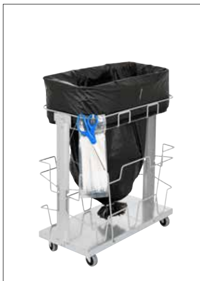
Stand Midi Dynamic UBS