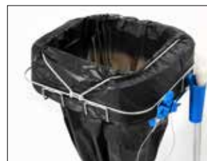
Rubber band Item no. 3102 This accessory can be used together with all Longopac cassette holders. Effectively locks the cassette in place and prevents it from unravelling.